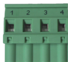
Power supply terminal for RES-407 with Art. no.

The terminal strip for the power supply (terminals 1 to 4) is no longer mechanically compatible with the previous terminal strip. However, the terminal assignment has remained identical. Representation of the terminal strips: