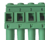
Power supply terminal for RES-5007 with Art. no.